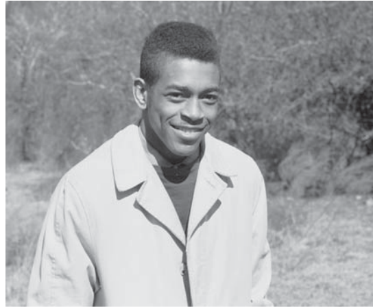
Hollis Watkins, 1963