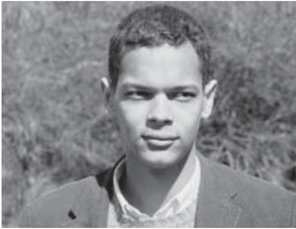
Julian Bond, 1963