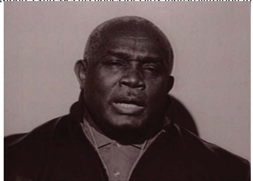
Amzie Moore, as he appeared in Dream Deferred , 1964

The film then turns to the SNCC voter registration drive activities at Rust College, an all black institution in northern Mississippi. Amzie had taken Richards to the campus, a single three story brick building, to meet with SNCC activists. Moore gathered up students from several classes to meet with Richards. Sitting together in a room, the eight or ten students were at first perplexed, wondering who this filmmaker was who had interrupted their studies. During the discussion, one of the students asked Richards what film he had made about the voter registration drive. When they learned it was We’ll Never Turn Back , smiles broke out all around. They had all seen the film and happily agreed to participate in the making of Dream Deferred . Their faces and voices fill the middle portions of the film, telling about their activities in the voter registration work