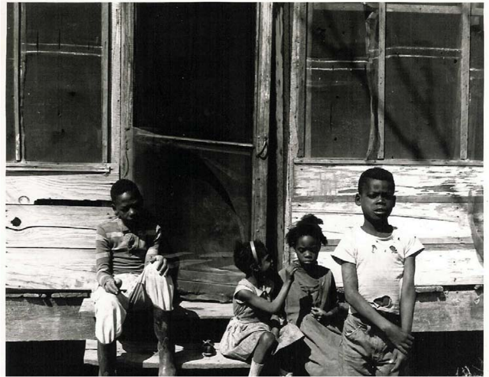
Children on the porch, Mississippi, 1963