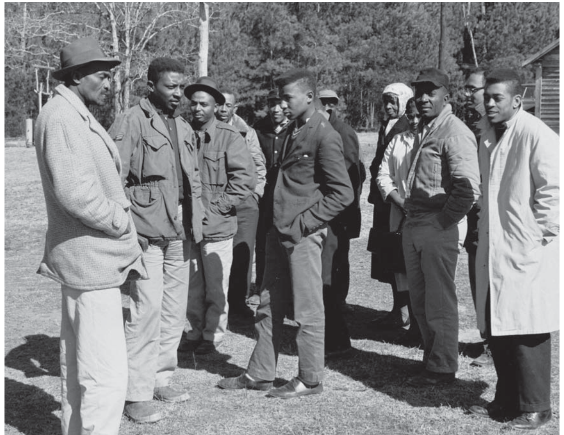
Voter Registration Activists, many of whom appear in We'll Never Turn Back . Mississippi, 1963